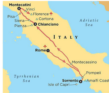
Map shows tour cities and the number of nights spent in each.

WHEN: March 10-25, 2018 (16 days/14 nights)